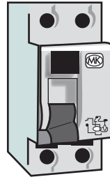
Dedicated RCD for the hot tub only is recommended

The size of cable required will be determined by an electrician based on the amperage and distance of the electrical run, USUALLY ARMoured CABLE IS USED IN OUTDOOR SITUATIONS